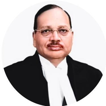
JUSTICE SURYA KANT, HON'BLE JUDGE SUPREME COURT OF INDIA CHIEF GUEST

ON 11 AUGUST 2025 AT 5:00 PM IST/12:30 BST